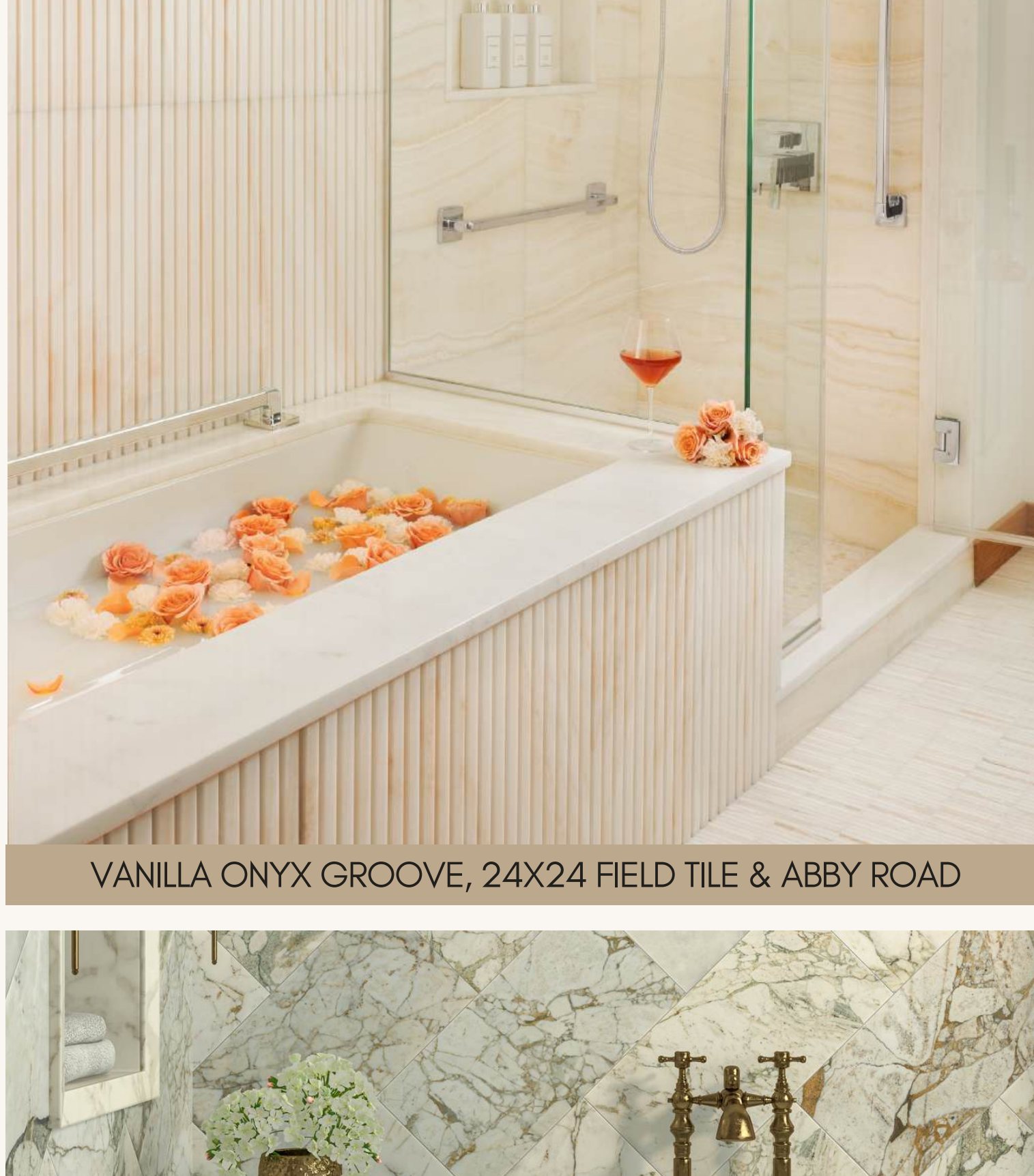
VANILLA ONYX GROOVE, 24X24 FIELD TILE & ABBY ROAD