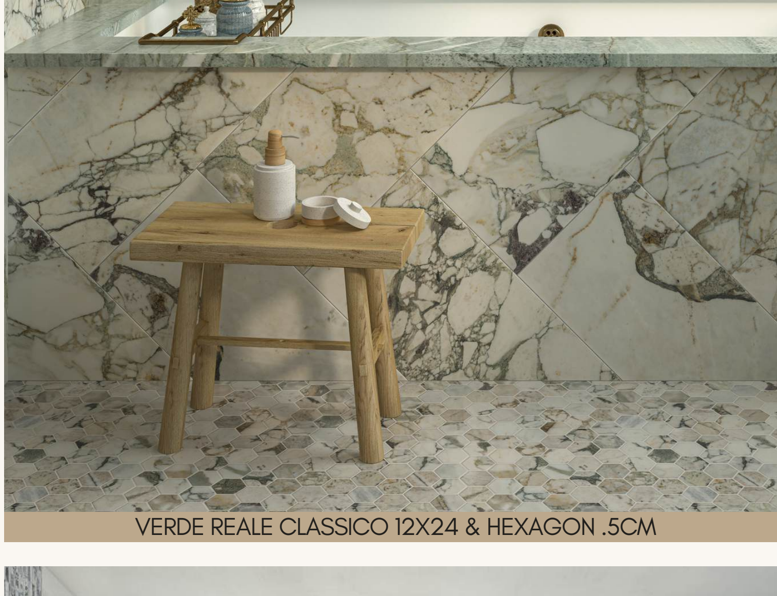
VERDE REALE CLASSICO 12X24 & HEXAGON .5CM