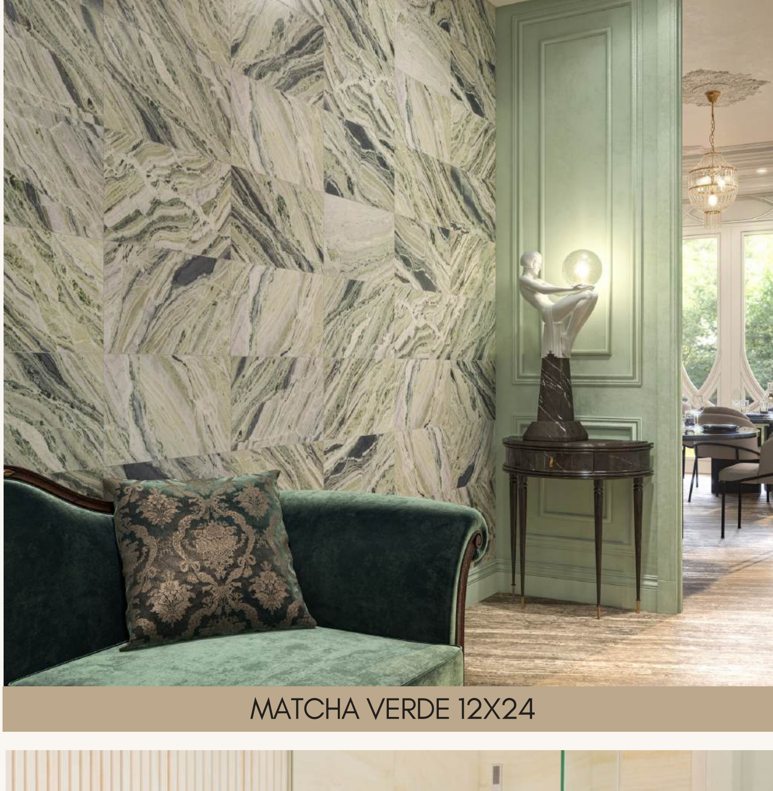
MATCHA VERDE 12X24