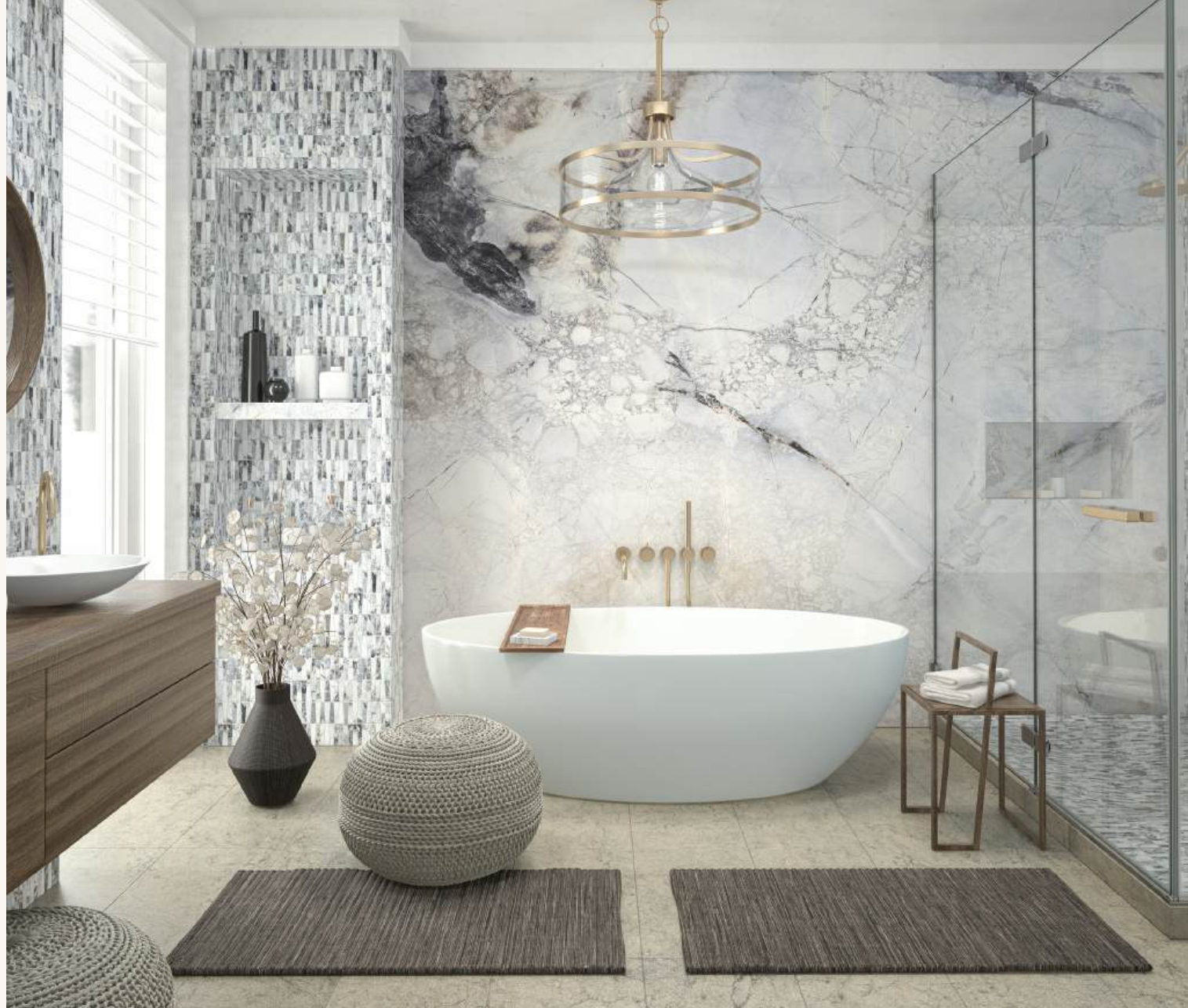
INVISIBLE BLUE SLAB & MOSAIC