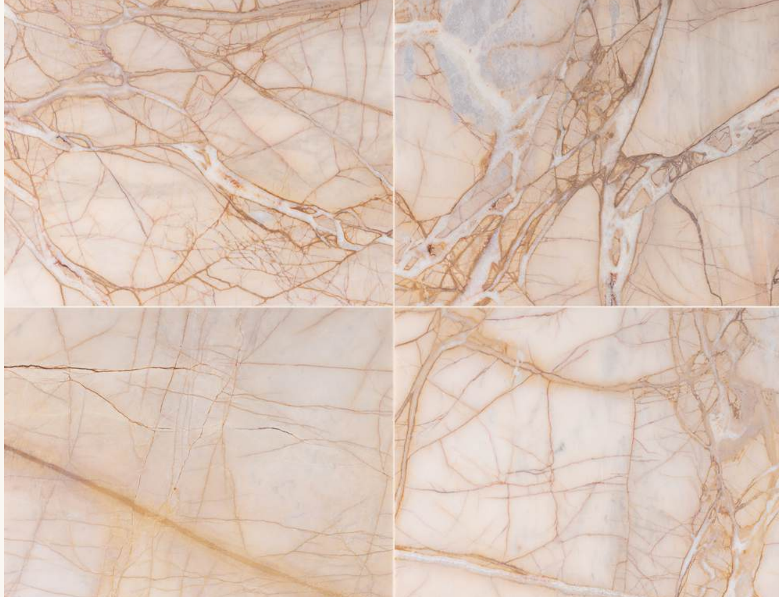
DOLOMITI SUNSET | 18X18 AND SLAB

FOR MORE INFORMATION OR SAMPLES, CALL KYLE AT 402.415.2804