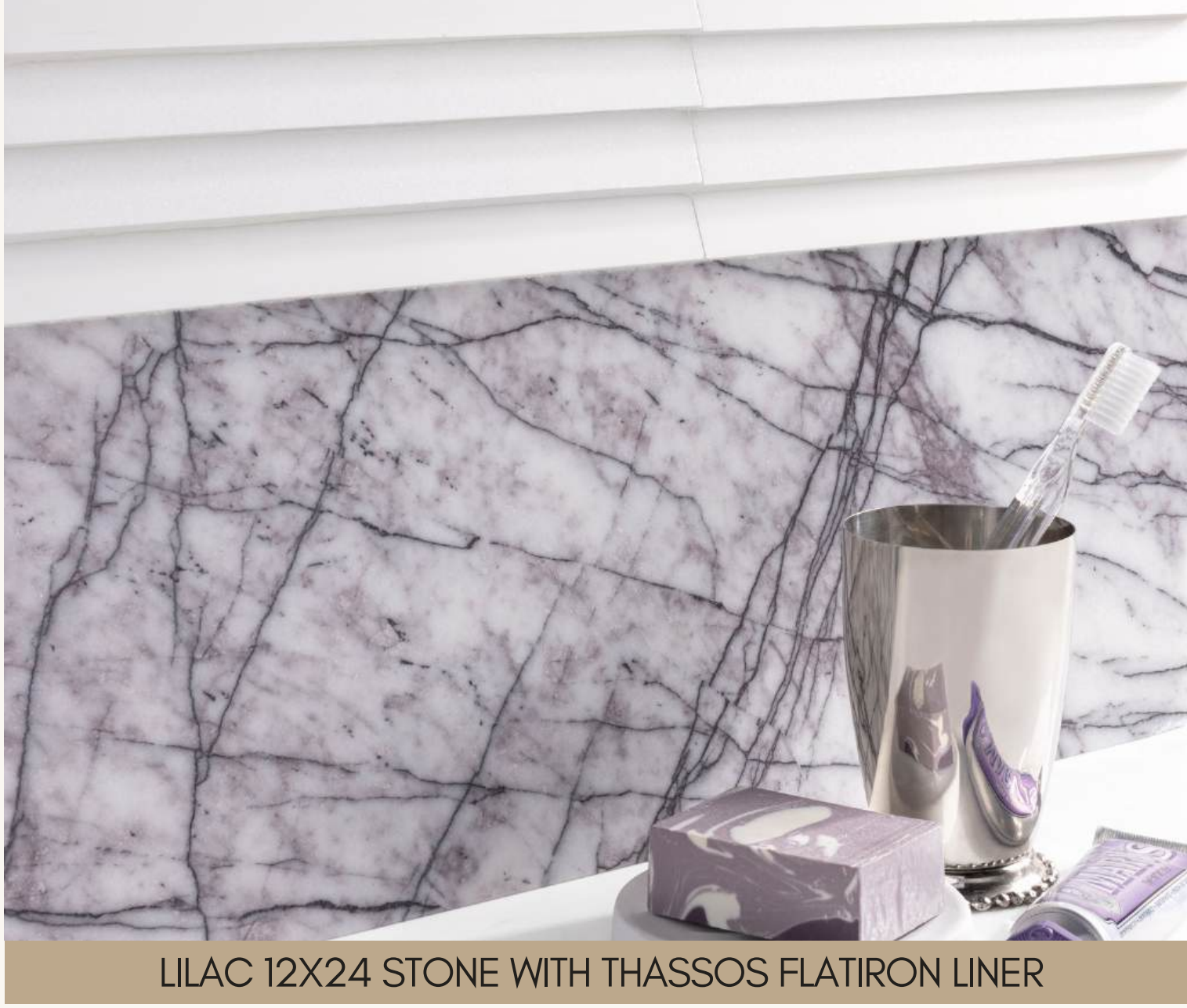
LILAC 12X24 STONE WITH THASSOS FLATIRON LINER

Discover a world of rare beauty with our curated selection of exotic natural stone field tiles — options you won't find anywhere else in the local market. From the striking veining of Turkish Lilac to the vibrant depth of Matcha Verde and the iridescent glow of Onyx Pearl, each stone is a work of art created by nature. Most styles are also available in matching slabs, perfect for creating seamless, statement-worthy spaces. These aren't just surfaces — they're showstoppers.